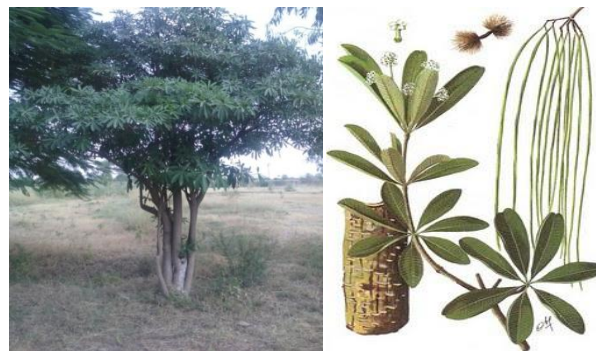
Figure – 1: Saptaparnai Tree

white. The tip of the leaf is rounded or shortly pointed, tapering towards the base. 3